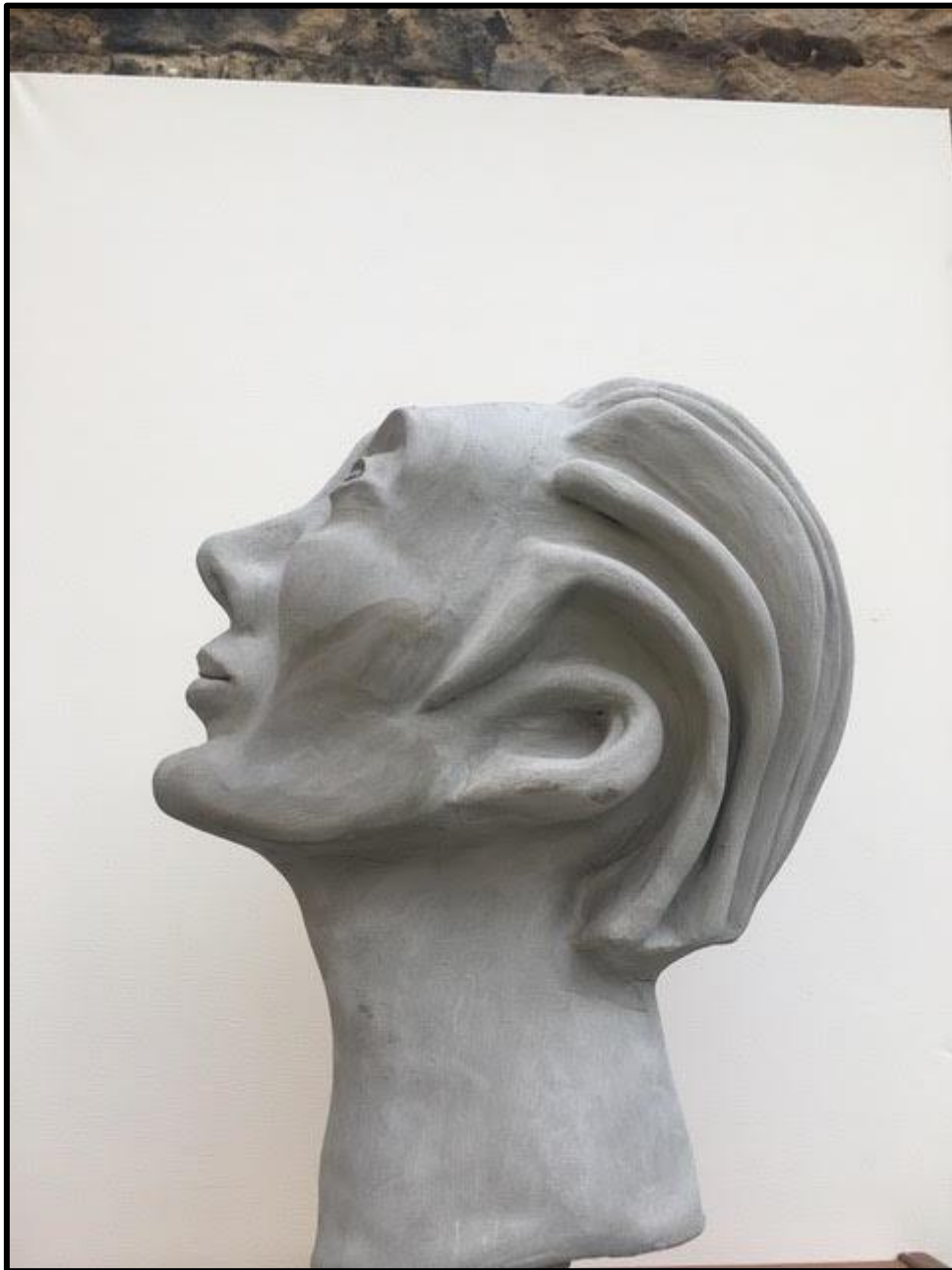
Artwork Copyright © 2020 Sally Freedman