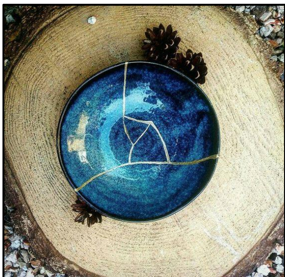
Bowl and Photo © 2020 Kin Boru

There is a tradition in Japanese pottery called kintsugi , described as “the art of precious scars”, which I became very interested in when I first heard about it a few years ago. If a pot is cracked or broken, it is not regarded as flawed or